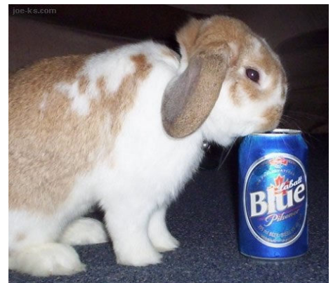
The Easter Bunny: The morning after.